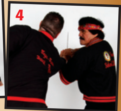
4 Locking the thumb with both hands, Dantes also attacks the elbow of the attacker's straightened arm with his bodyweight behind his left arm...