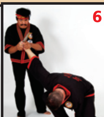
Applying the wrist-lock, Dantes controls his attacker and drives him down to his knees...