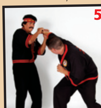
GM Dantes consolidates his grip and swings the attacker's arm clockwise and up, as he prepares to apply a wrist-lock.