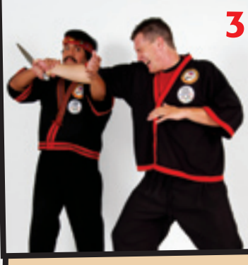
Continuing the momentum of his strike, GM Dantes brings the weapon-arm high as his right hand moves to secure control of the attacker's wrist...