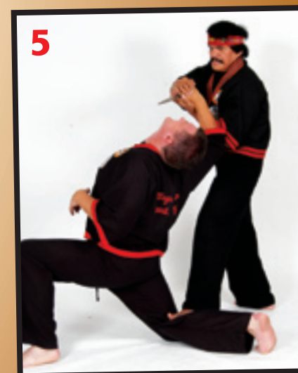
5 ...then stomps the side of the attacker's knee into the ground, as he forces the knife back towards the attacker.