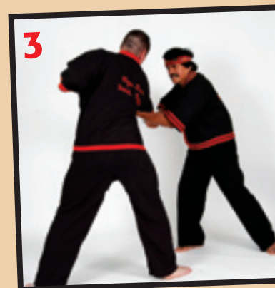
3 ...then passes the knife-arm through to his left, moving his lead leg back to avoid being cut. His right hand is controlling the knife-hand.