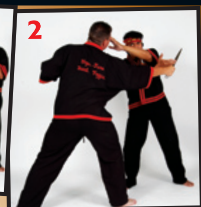
2 As he thrusts the knife, GM Dantes angles off and deflects the knife attack while attacking the eyes...