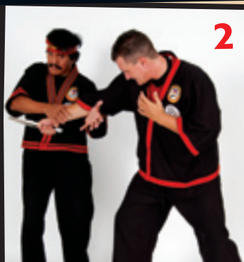
...he steps obliquely to his left, checking the knife-hand while simultaneously striking the attacker's elbow joint.