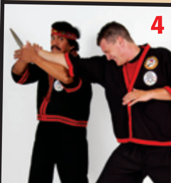
...then moves his left arm from the attacker's elbow and locks the attacker's thumb to gain control of the knife.