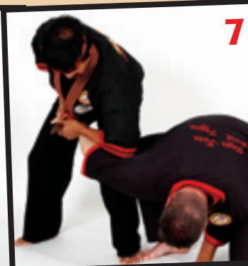
...then steps in with his left leg, rolling the knife-hand to his right and applying leverage down on the arm.